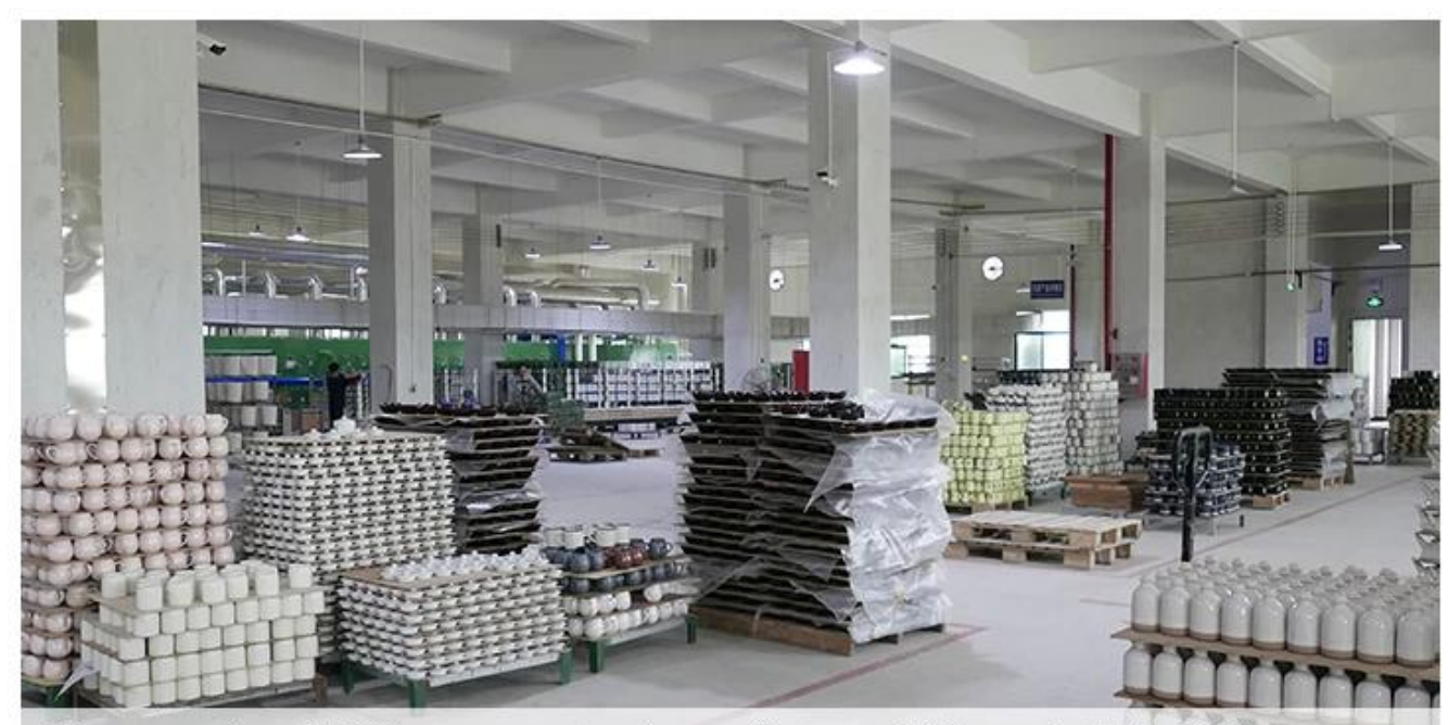
There are about 20000 square meters in our factory which was built in 1992 year; Superior quality and high efficiency can be guranteed.