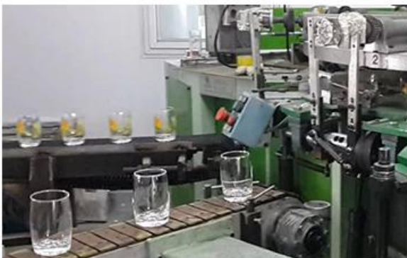
05 SCREEN PRINTING