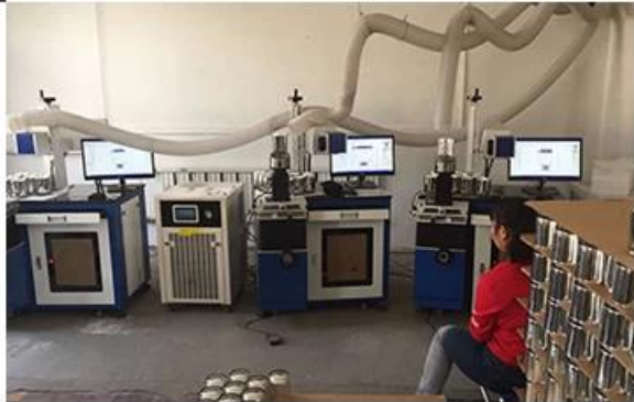
02 LASER ENGRAVING