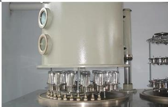
04 VACUUM ELECTROPLATING