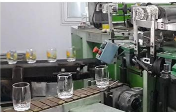
05 SCREEN PRINTING