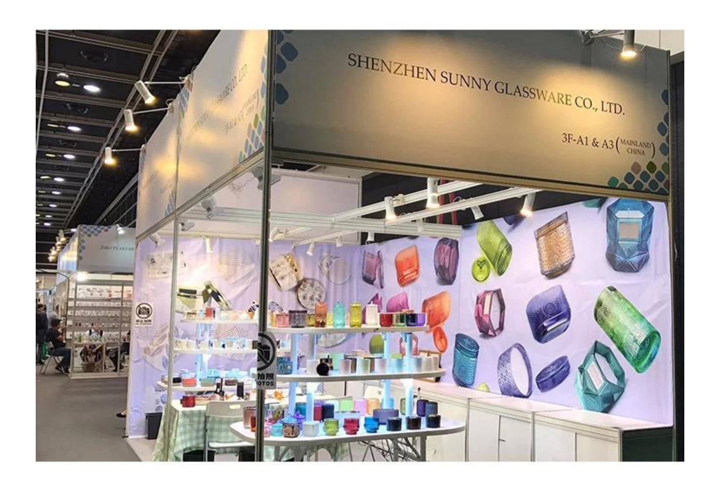
We have taken part in various exhibitions since 2002 year, like Shanghai, London, Las Vegas, Hongkong show.