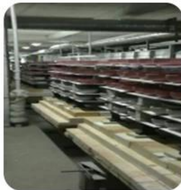
8、 Glazed Firing