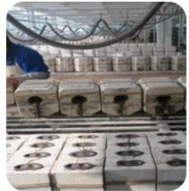
3、 Platform Casting