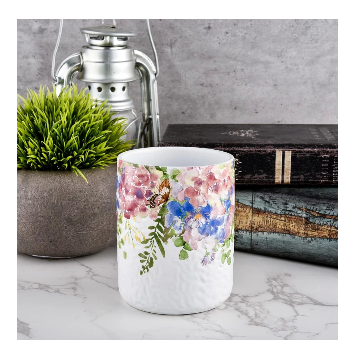
Why Choose Sunny Glassware