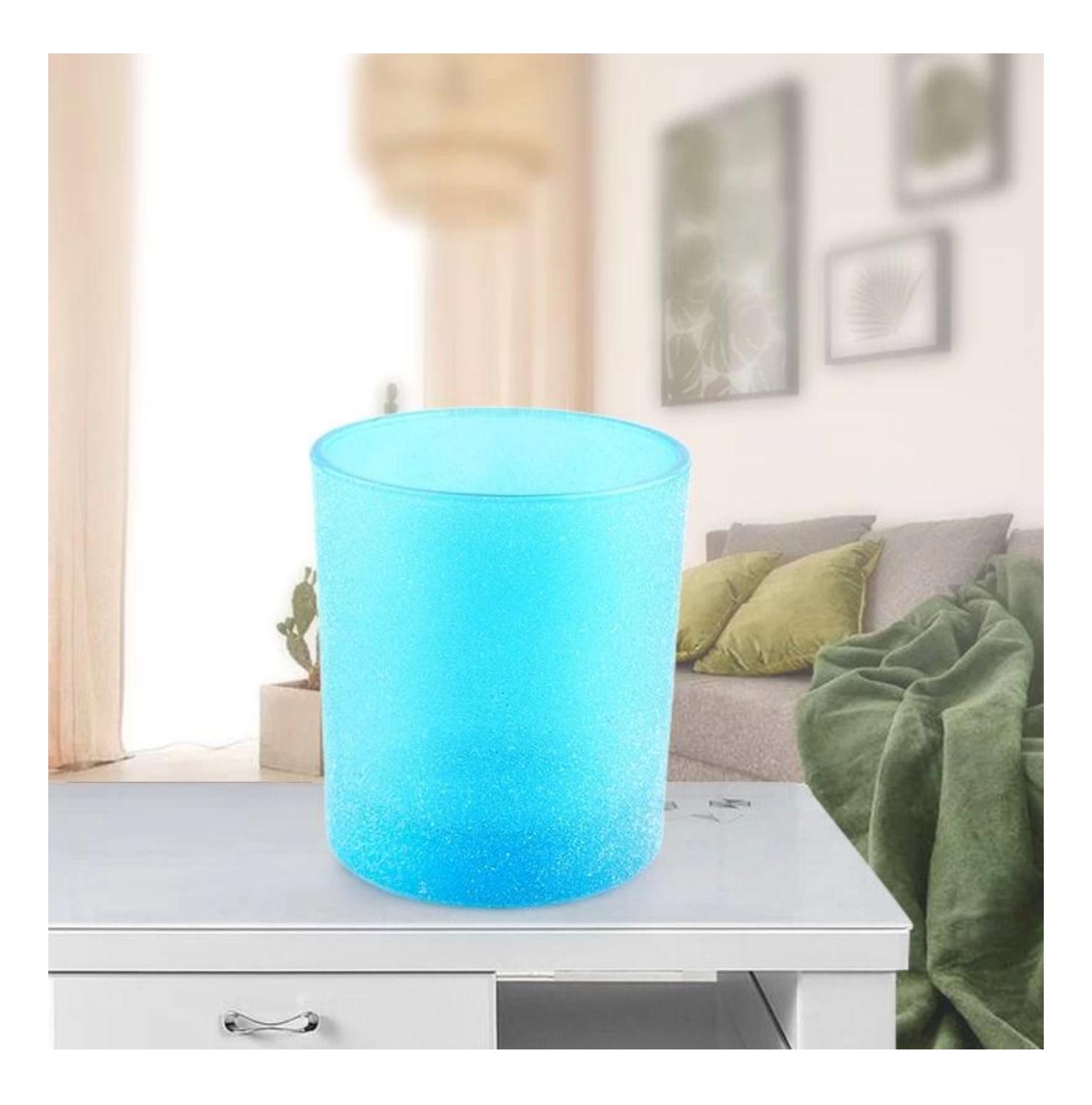
<u>Sunny Glassware</u> offers customized graphic design for glass jar decorations and molding service for glass jars and glass lids.