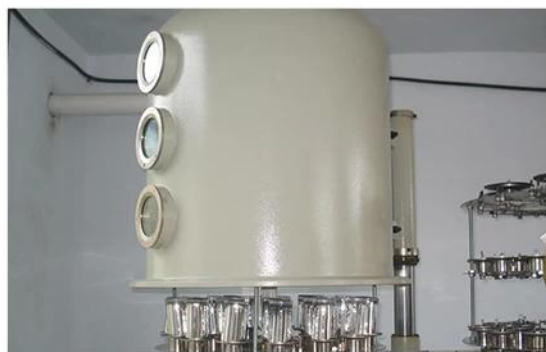
04 VACUUM ELECTROPLATING