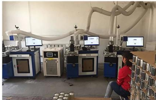
02 LASER ENGRAVING