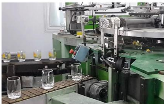
05 SCREEN PRINTING