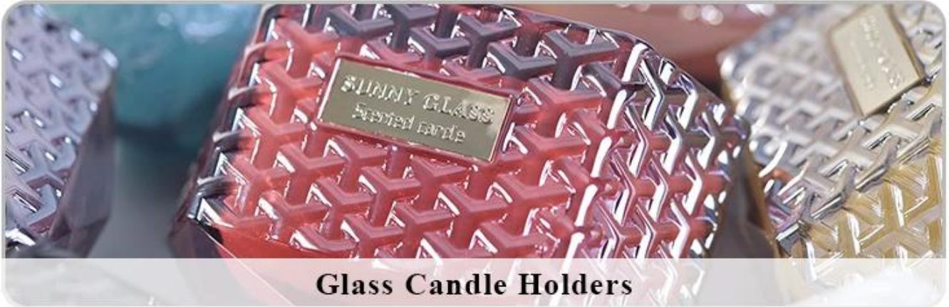
Glass Candle Holders