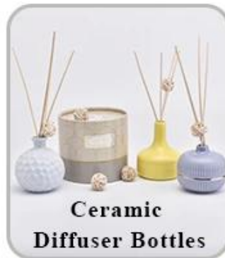
Ceramic Diffuser Bottles