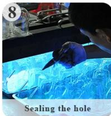
Sealing the hole