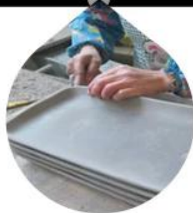
8、 Glazed Firing