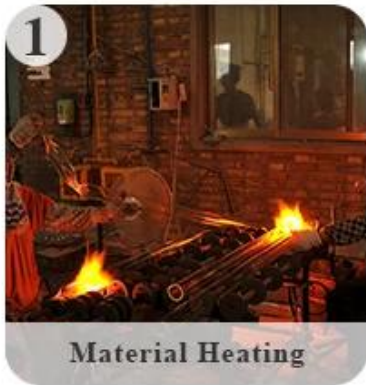
1 Material Heating