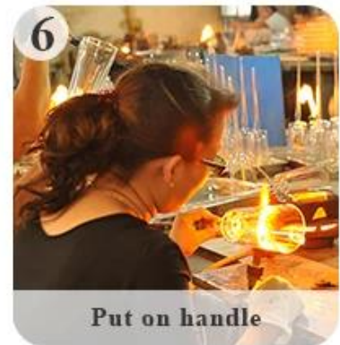
6 Put on handle