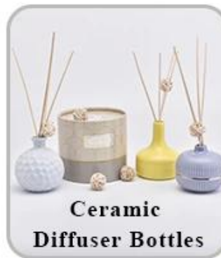
Ceramic Diffuser Bottles