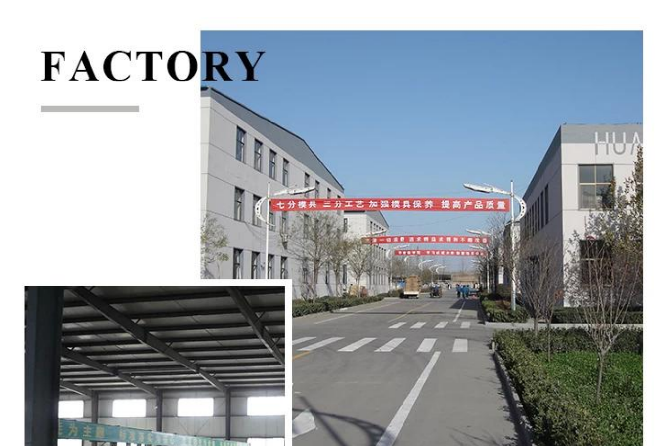
There are about 20000 square meters in our factory which was built in 1992 year; Superior quality and high efficiency can be guranteed.