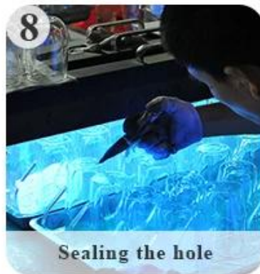
Sealing the hole