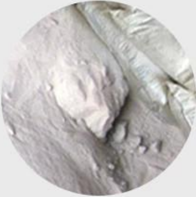
1、 Raw Material