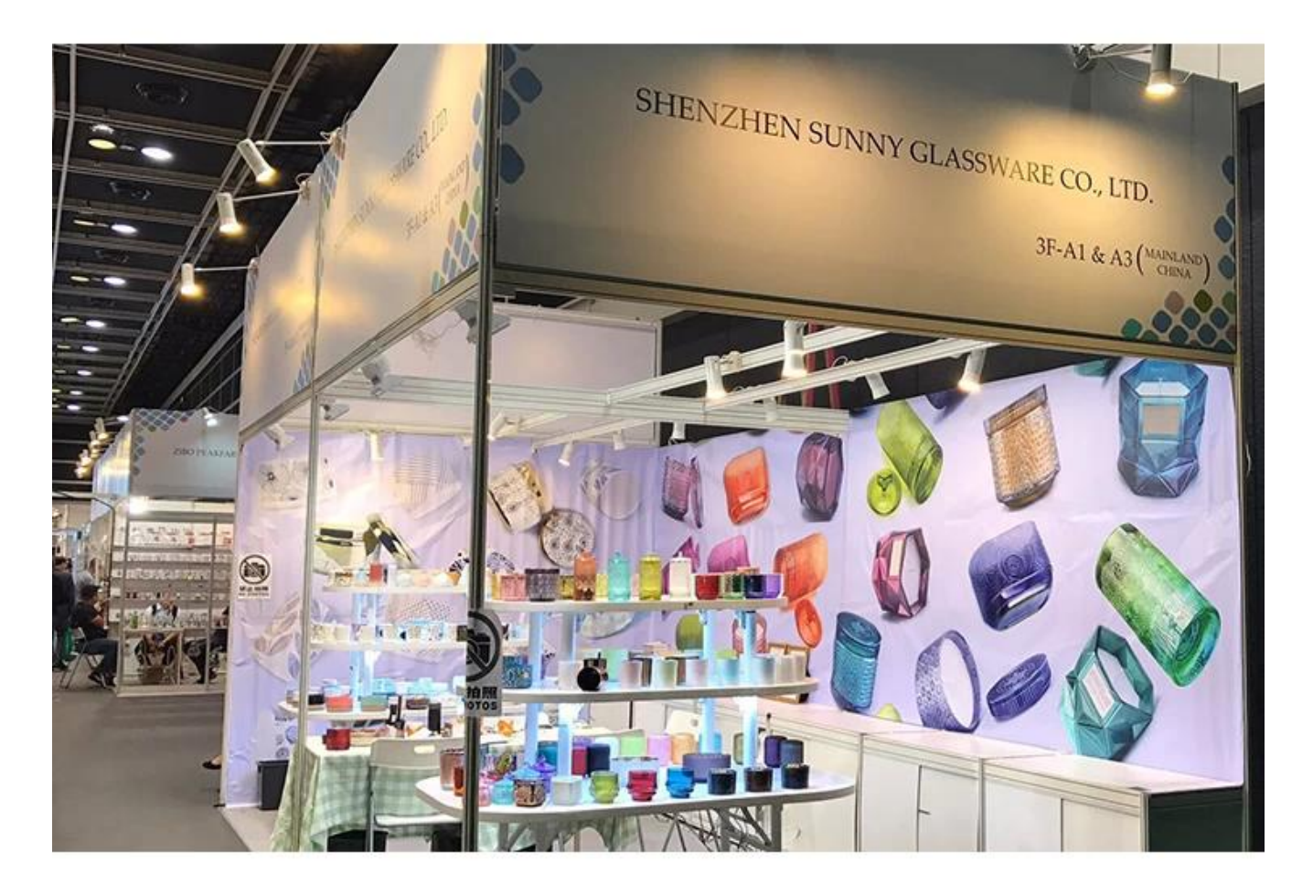
We have taken part in various exhibitions since 2002 year, like Shanghai, London, Las Vegas,Hongkong show.