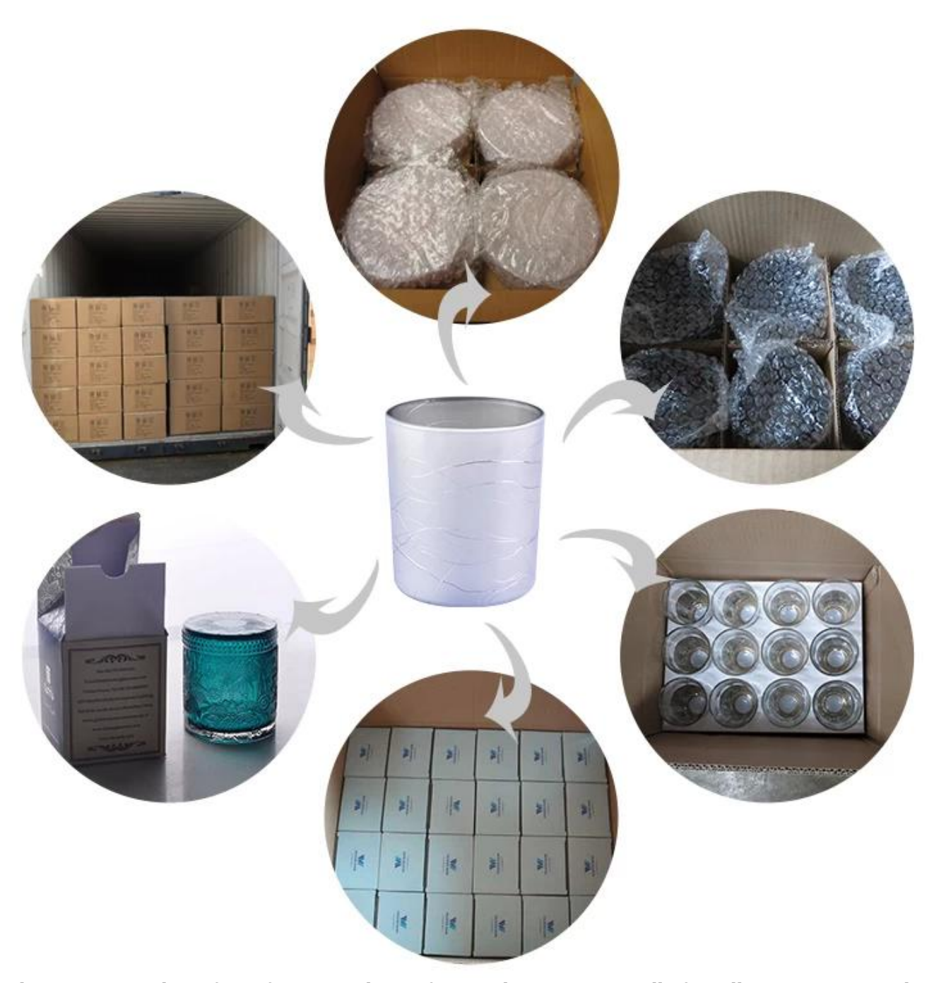
To better ensure the safety of your goods, professional, environmentally friendly, convenient and efficient packaging services will be provided. Company Profile