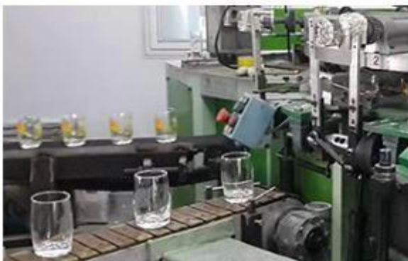
05 SCREEN PRINTING