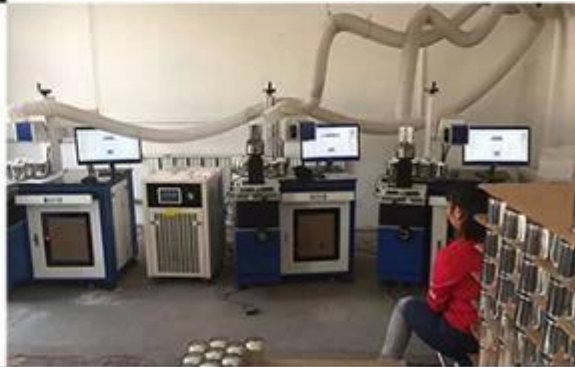
02 LASER ENGRAVING