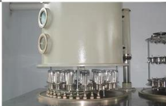
04 VACUUM ELECTROPLATING