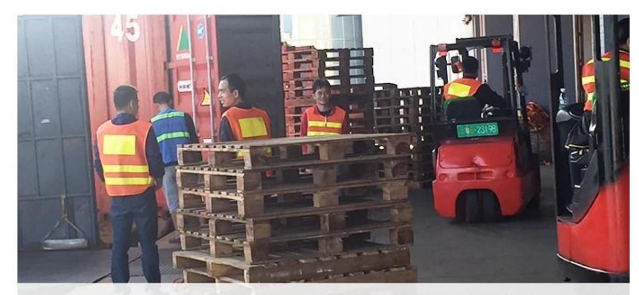
Own professional shipping company( Shenzhen Sunny Worldwide logistics)