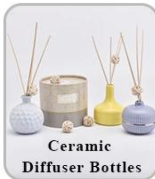
Ceramic Diffuser Bottles