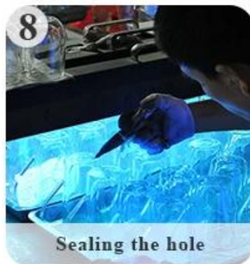
Sealing the hole