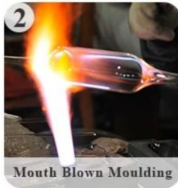
Mouth Blown Moulding