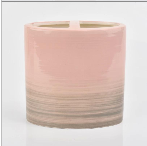
Toothbrush holder SGMK18102402-3 Top dia:112mm Bottom dia:63mm Height:111mm Weight:265g