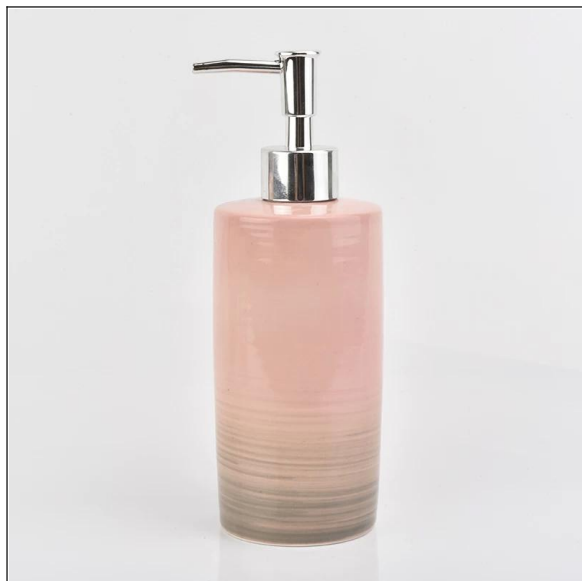
Lotion dispenser SGMK18102402-4 Top dia:22mm Bottom dia:67mm Height:154mm/205mm with lid Weight:295g Capacity: 450ml

(All the images on this site are copyrighted by Sunny Glassware. Any unauthorized reprinting will be regarded as copyright infringement.)