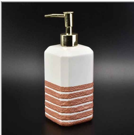
Lotion dispenser SGMK18102411-4 Top dia:22mm Bottom dia:78mm Height:160mm/203mm with lid Weight:400g Capacity:670ml

(All the images on this site are copyrighted by Sunny Glassware. Any unauthorized reprinting will be regarded as copyright infringement.)