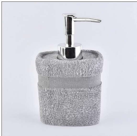
Lotion dispenser SGSJL18111601-4 Top dia:90mm Bottom dia:45mm Height:95mm Weight:475g Capacity: 100ml

(All the images on this site are copyrighted by Sunny Glassware. Any unauthorized reprinting will be regarded as copyright infringement.)