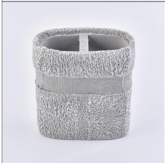
Toothbrush holder SGSJL18111601-3 Top dia:90mm Bottom dia:50mm Height:90mm Weight:282g