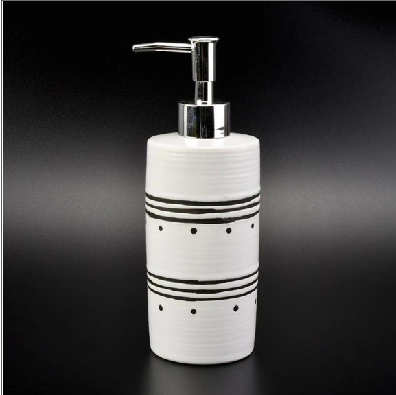
Lotion dispenser SGMK18102401-4 Top dia:22mm Bottom dia:67mm Height:154mm/205mm with lid Weight:295g Capacity: 450ml

(All the images on this site are copyrighted by Sunny Glassware. Any unauthorized reprinting will be regarded as copyright infringement.)