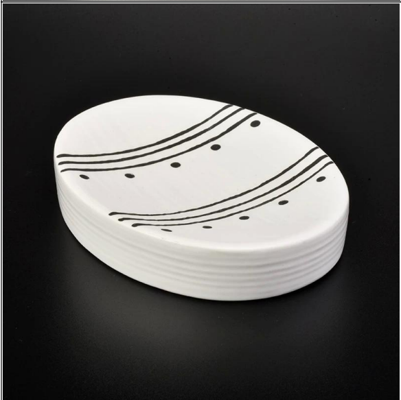
Soap dish SGMK18102401-1 Top dia:130mm Bottom dia:93mm Height:22mm Weight:160g