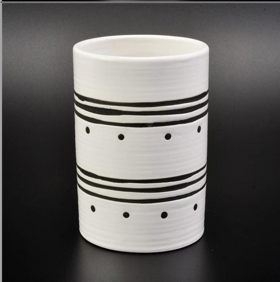
Tumbler SGMK18102401-2 Top dia:73mm Bottom dia:70mm Height:107mm Weight:205g Capacity: 330ml