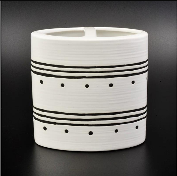
Toothbrush holder SGMK18102401-3 Top dia:112mm Bottom dia:63mm Height:111mm Weight:265g