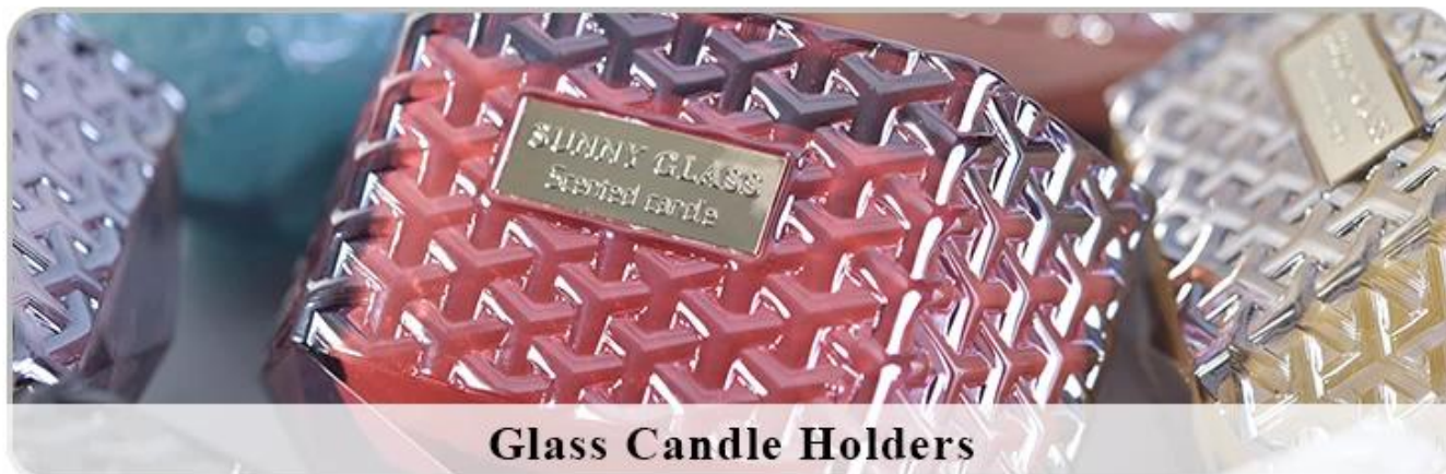
Glass Candle Holders