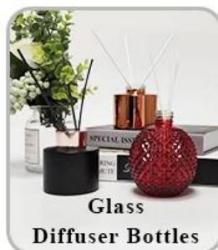
Glass Diffuser Bottles