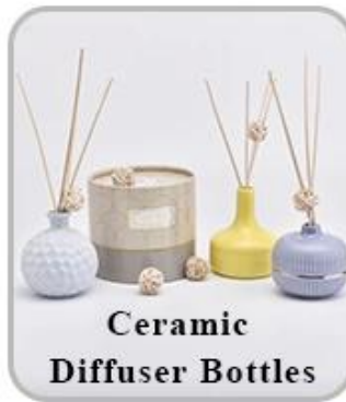
Ceramic Diffuser Bottles