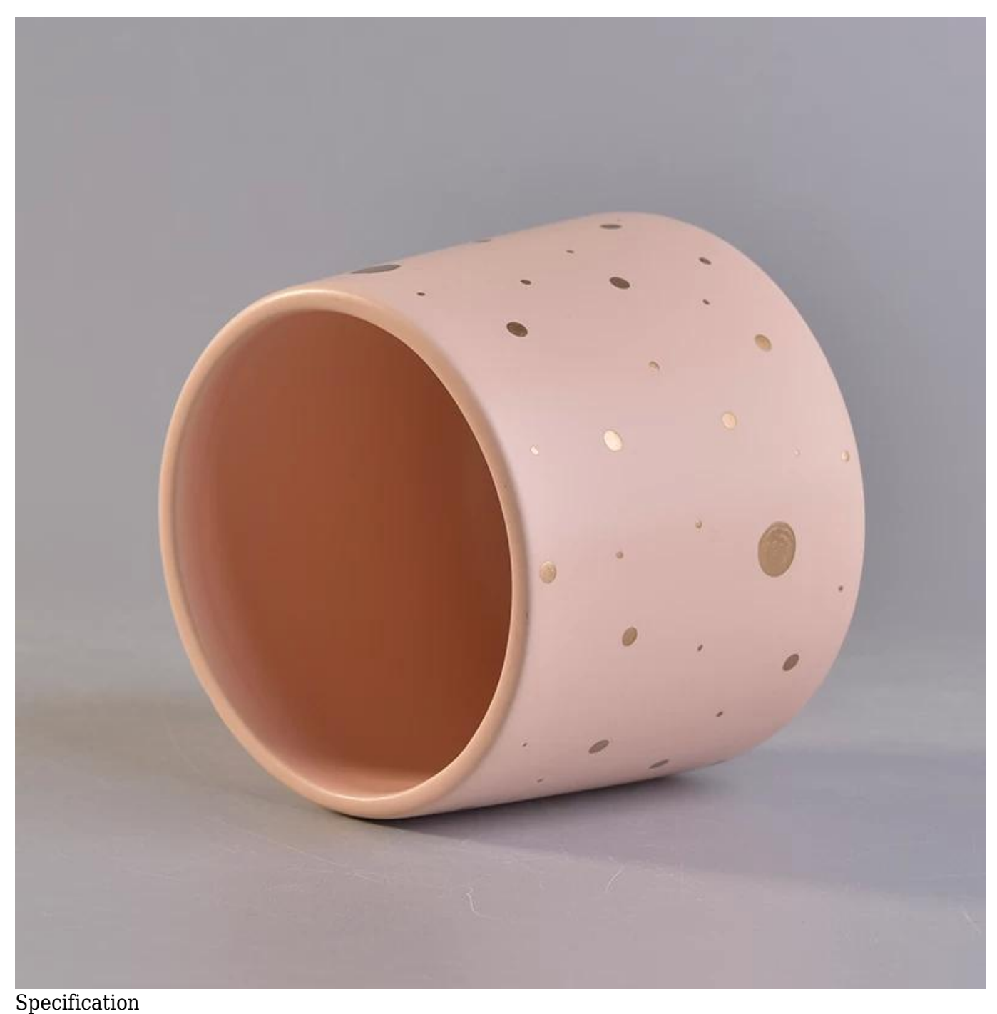
Product name 10oz 12oz Customized matte candle ceramic holder with wooden lid Packing Normal packing, Individual gift box, PVC box, window box, color box, white box, etc.

Delivery time Within 35 days after the sample and order confirmed Why Choose Us