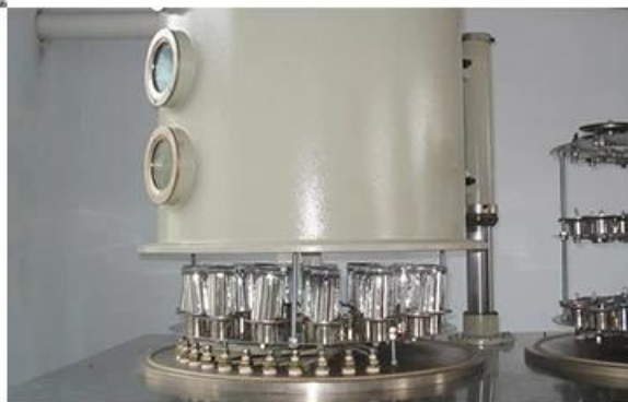
04 VACUUM ELECTROPLATING