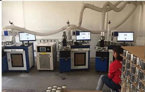
02 LASER ENGRAVING