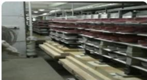
8、 Glazed Firing