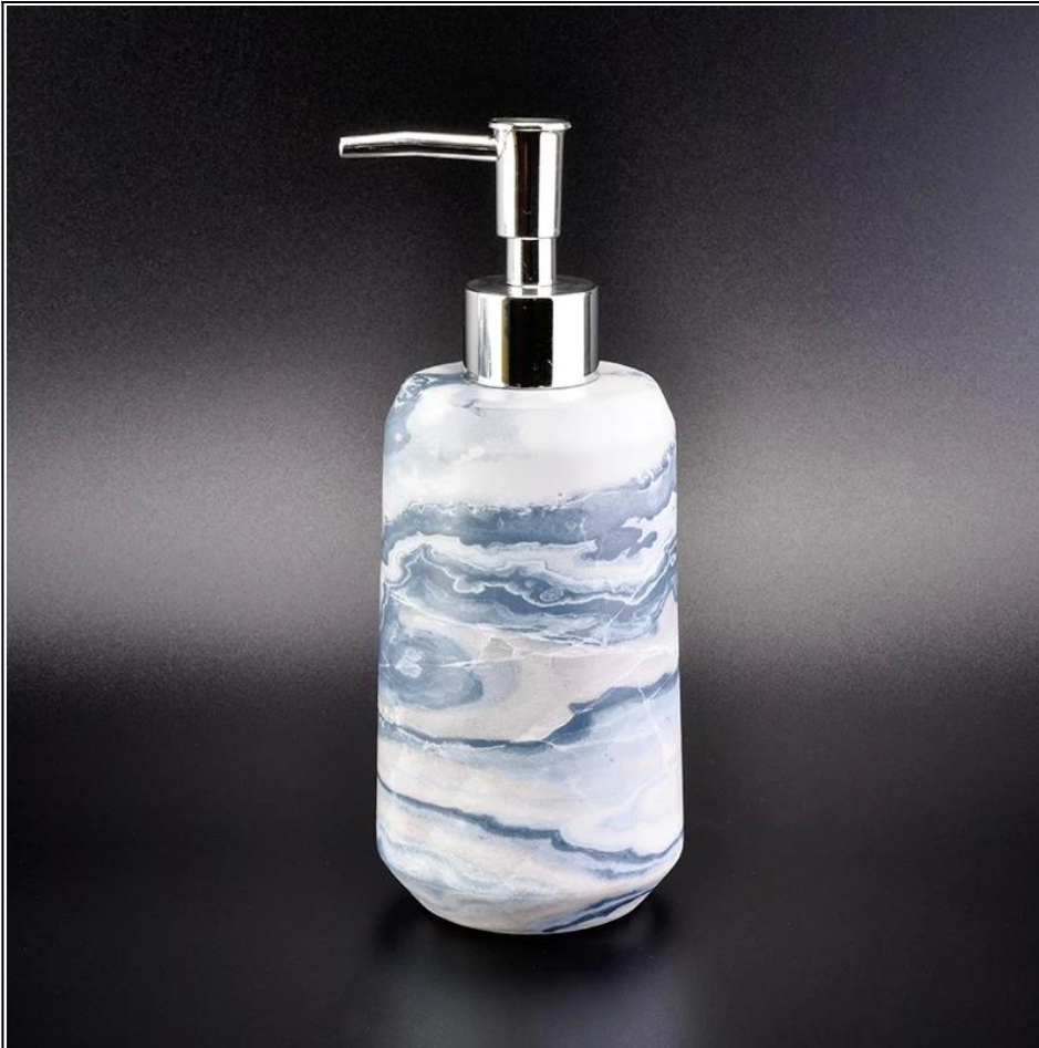
Lotion dispenser SGMK18110501-4 Dia: 78mm Height: 143mm Weight: 323 g Capacity: 380ml