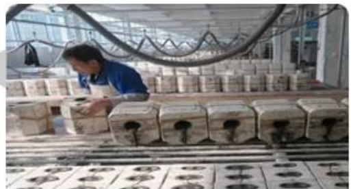
3、 Platform Casting