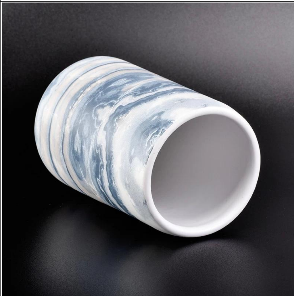
Tumbler SGMK18110501-2 Top dia: 62mm Bottom dia: 78mm Height: 115mm Weight: 270 g Capacity: 290 ml