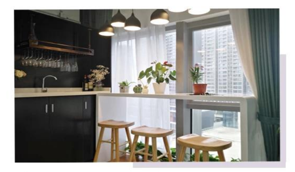
There are over 5000 products in sample room of Sunny Glassware for your choice. No second Co. in China!