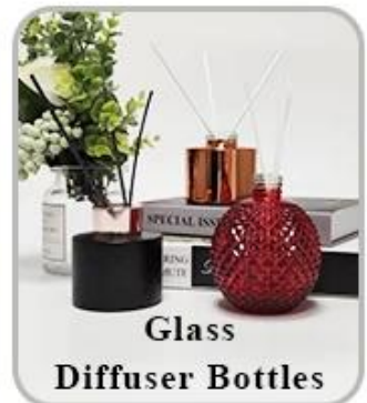
Glass Diffuser Bottles