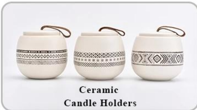
Ceramic Candle Holders