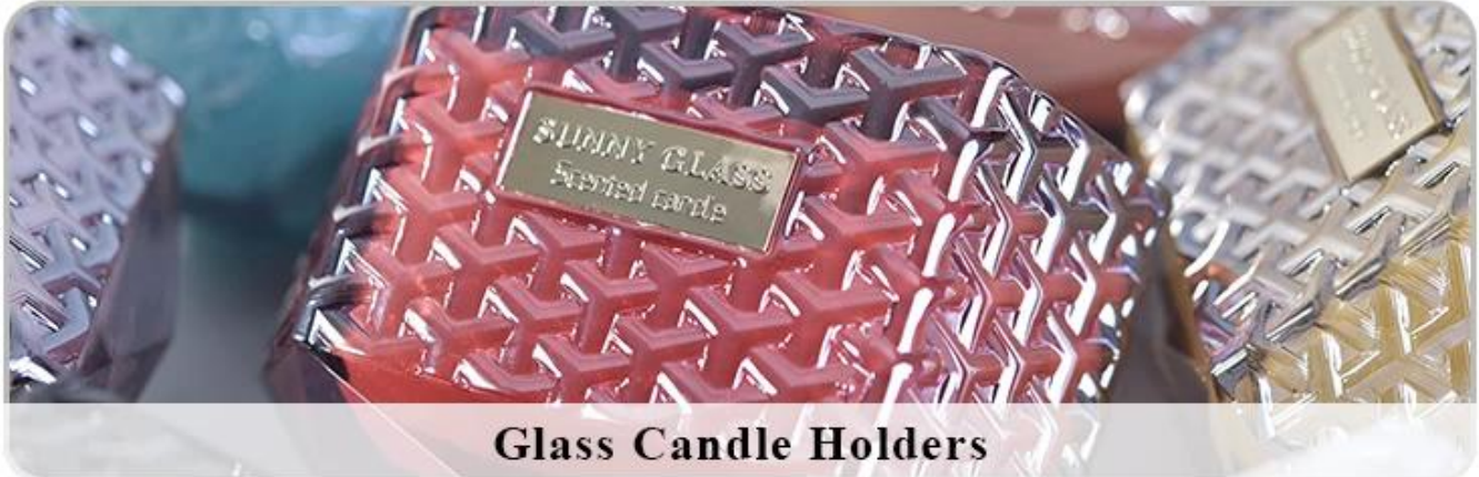
Glass Candle Holders