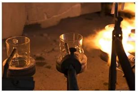
Superior quality and high efficiency can be guranteed.