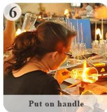
Put on handle