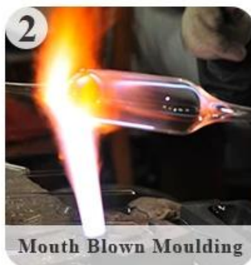
Mouth Blown Moulding