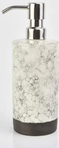
Lotion dispenser SGMK18102408-4 Top dia:22mm Bottom dia:67mm Height:154mm/205mm with lid Weight:295g Capacity: 450ml

(All the images on this site are copyrighted by Sunny Glassware. Any unauthorized reprinting will be regarded as copyright infringement.)