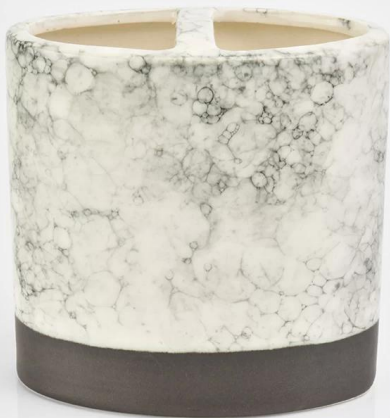
Toothbrush holder SGMK18102408-3 Top dia:112mm Bottom dia:63mm Height:111mm Weight:265g